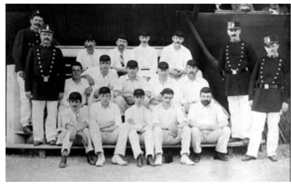
The reigning Olympic Cricket Champions from 1900, seen here with the French moustache growing team

Although most cricketers will continue much as before - playing in CyCF competitions and, perhaps, hoping for international tournaments, KOA rules about sports teams means that, for some competitions, the