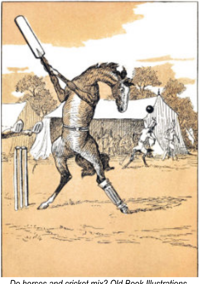
Do horses and cricket mix? Old Book Illustrations, London, 1891

In Cyprus we're lucky with the weather and it's very unusual for rain to stop play, but in Kochi in November 2017 that