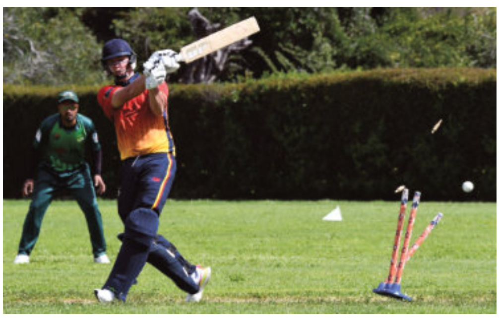
Ouch. One of the worst things about being clean bowled is the sight of a grinning photographer who's got the shot

After a brief summer break the Autumn T20 was contested from September to December. Markhor, Limassol Qalandars and Nicosia Tigers all won all their group matches, but the once-invincible Punjab Lions had to rely on a superior net run rate to progress to the knockout