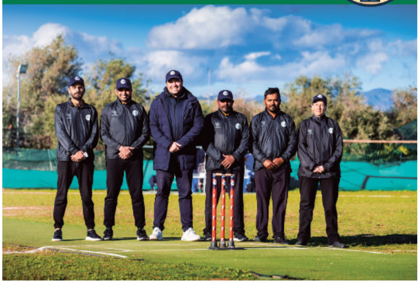
Taking her place with the other umpires for the January(!) ECN tournament

Howzat! Howzat possible? A female cricket umpire? Yes, we do exist. There's not many of us, particularly in Cyprus. My umpiring journey is quite unique in the fact that I have never played the game. How can somebody that's never played the game understand enough to make difficult decisions every match? The answer is getting on the field, dedication, determination, and the support of your local cricket federation.