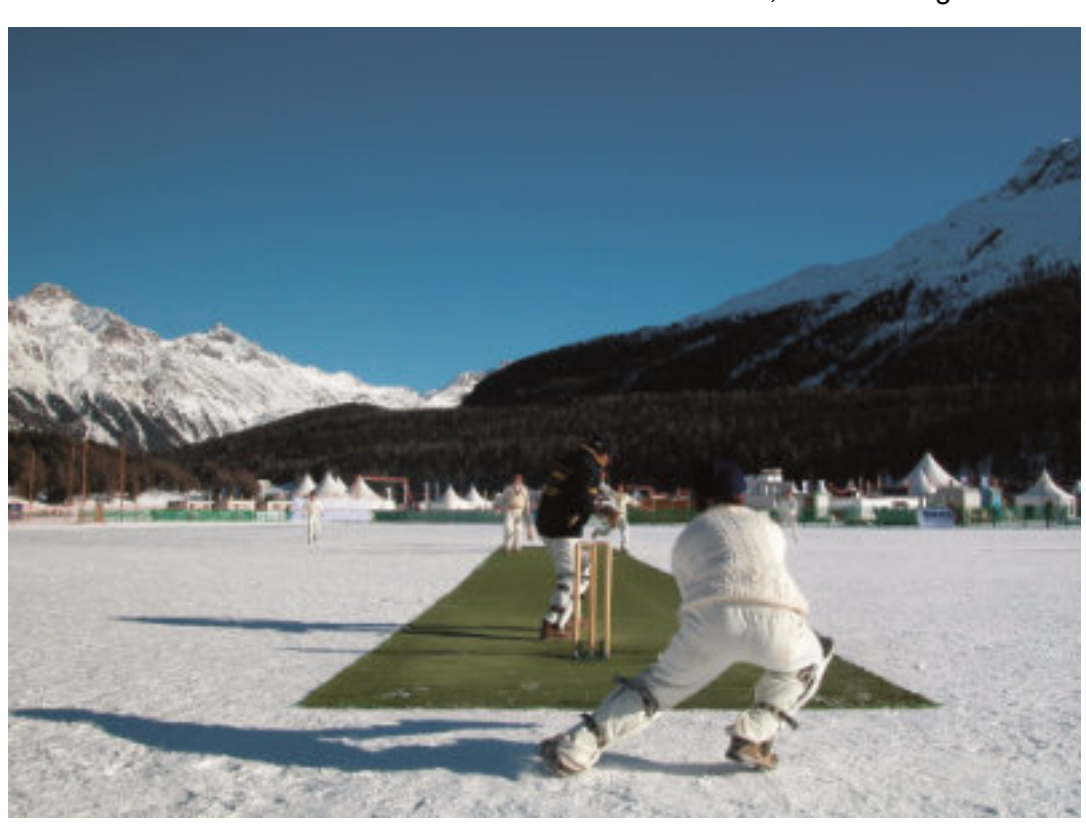
St Moritz Cricket Club offers a spectacular playing field

In a one up for cricket, footballers aren't even allowed to play at half that altitude, so 3-mile high cricket